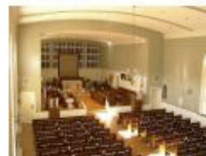
Candlelight On the Square More Information