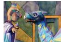
The Last Dragon on Earth More Information