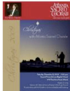
Christmas with Atlanta Sacred Choral More Information